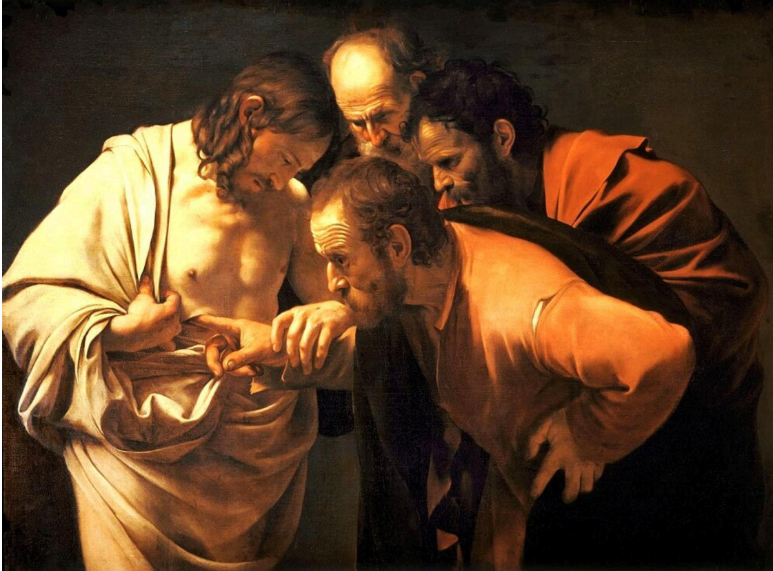
Caravaggio ~ Thomas circa 1602